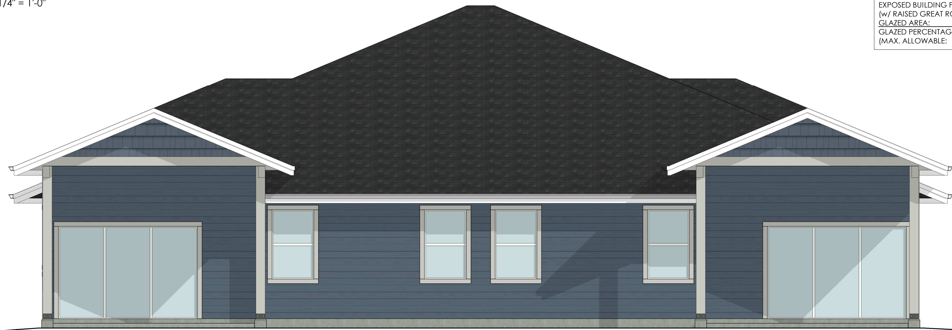
BACK ELEVATION SCALE: 1/4" = 1'-0"