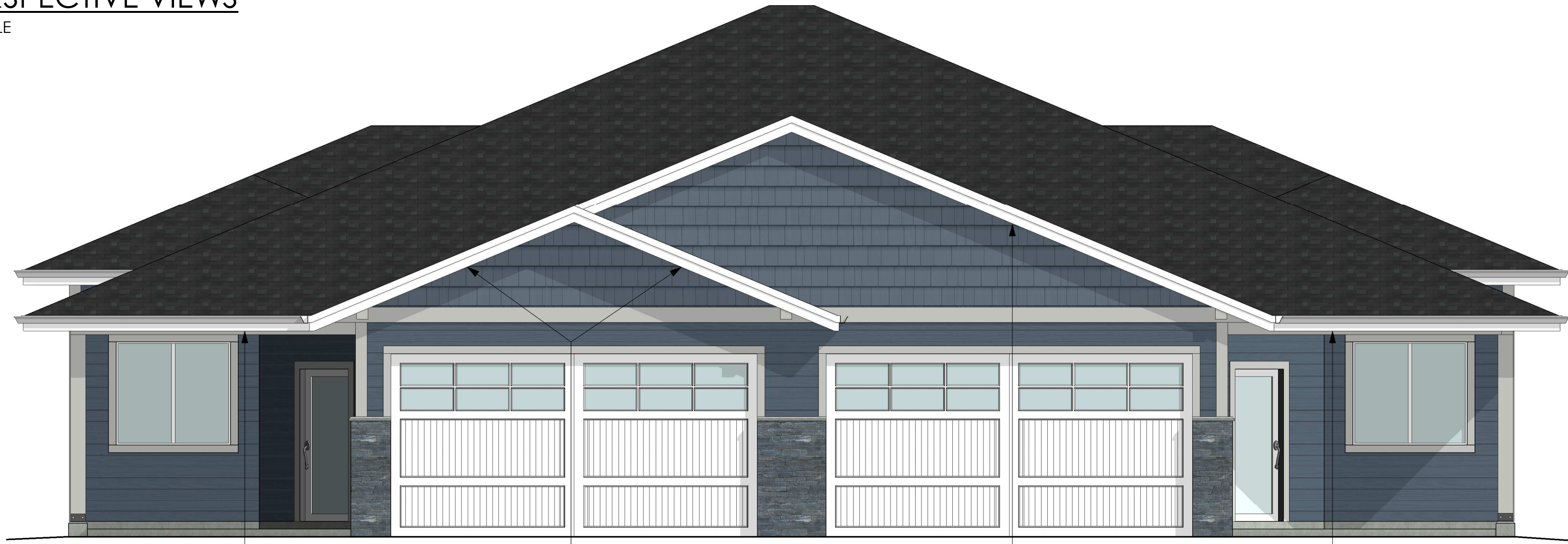
RECESSED LIGHTING IN SOFFIT AT ENTRY FRONT ELEVATION SCALE: 1/4" = 1'-0"

RECESSED LIGHTING IN SOFFIT ABOVE GARAGES